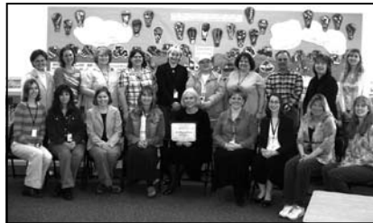
Central Valley Kindergarten Staff