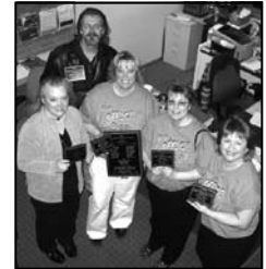
HEART Transportation Team